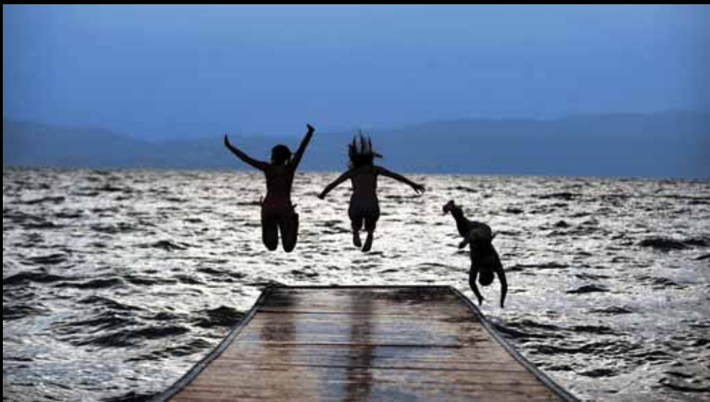
The Ohrid-Struga region: number one for cost effectiveness in Europe