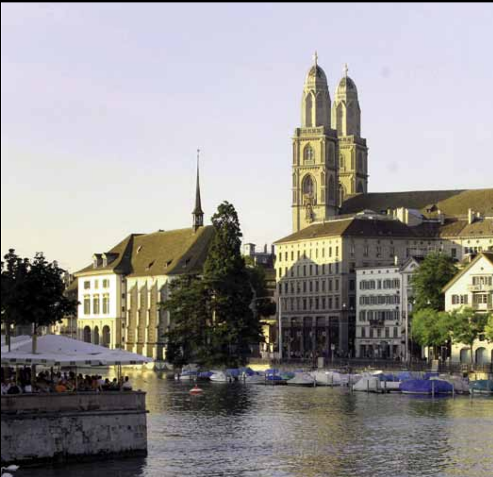
The Greater Zurich Region ranks first for economic potential of all the small regions in Europe