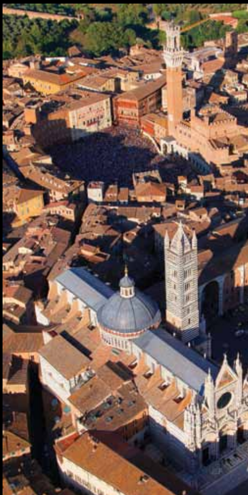
Tuscany ranks top southern European region for FDI Strategy